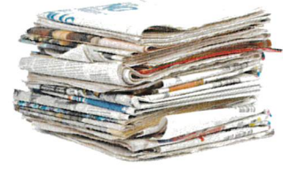
Newspaper, including inserts