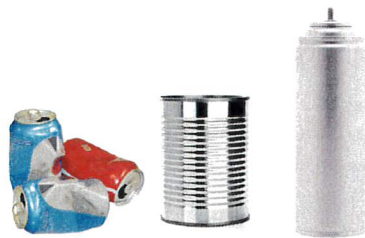
Aluminum cans, steel & tin cans