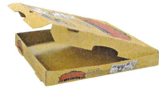
Clean Pizza Boxes