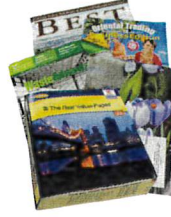
Magazines, catalogs and telephone books