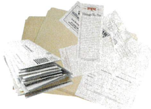
Office paper, junk mail, folders