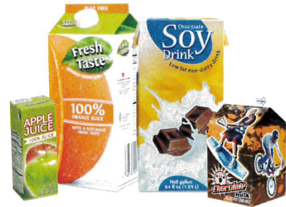
(caps and straws removed)